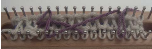
Accent yarn stitches.

Row 2. Tie on accent yarn at pin #5. Work stitch #5 and #13 in the accent yarn. Work row.